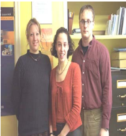
Staff of the Montmagny-L'Islet Community Development Corporation

To meet this need, CEDTAP provided funds for an elaborated business plan, one that explored alternative financing possibilities and set out the financing arrangement.